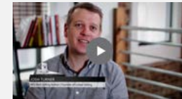
Part 3: Connect