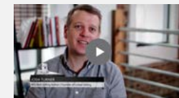
Part 3: Connect