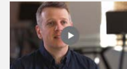
Part 2: Build