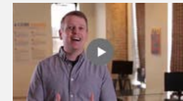
Part 1: Create