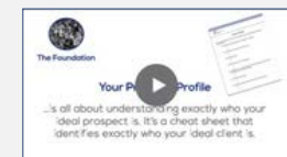
Part 4: Implementation