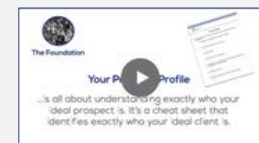
Part 4: Implementation